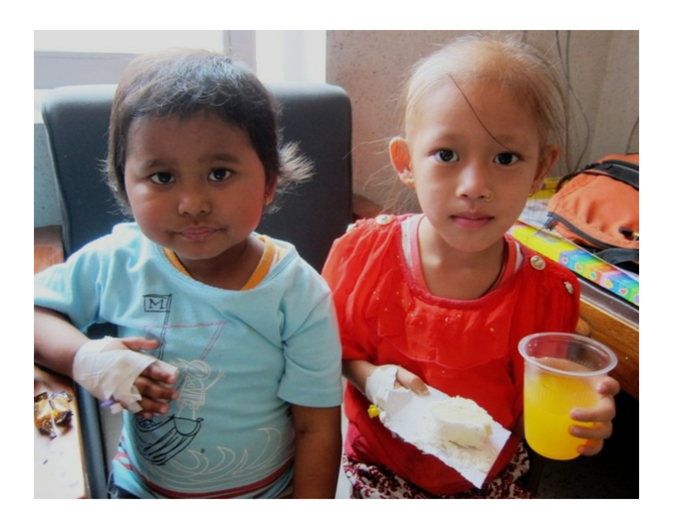
Above, see kids celebrating a recent birthday with balloons, cake, juice, candy, and a special gift for the birthday boy or girl. There was no shortage of smiles among the patients, family members, volunteers and hospital staff.