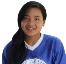
By: Susmita Chaudhary