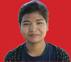
By: Ramita Chaudhary