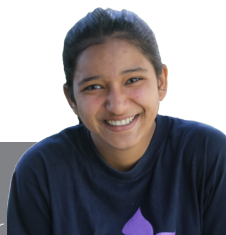
By: Muskan Pariyar