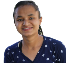
By: Sita Timalsina