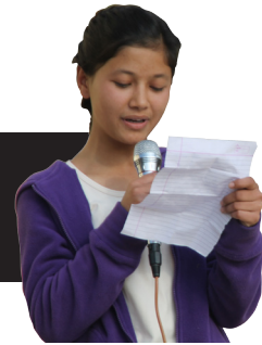
By: Anu Basnet