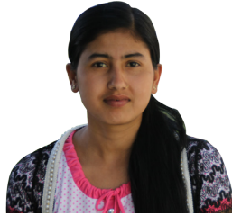
By: Gita KC