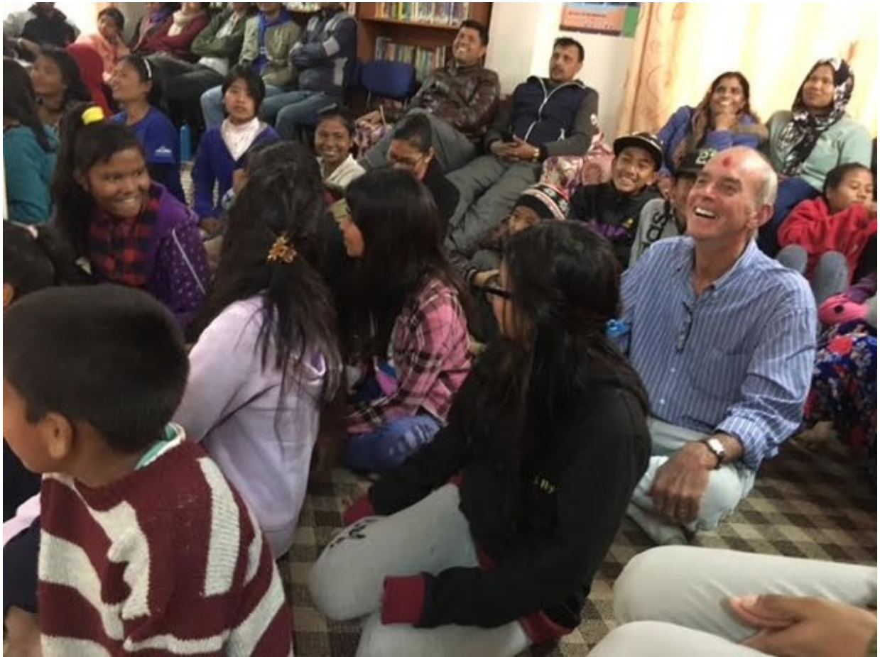
Sports Day! By Sita Timilsina, Class 9